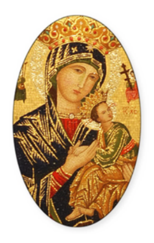
Vol. 22 No. 4